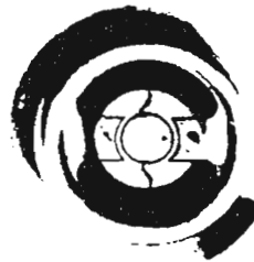
TWO-PRONG "E" GROUND ELECTRODES

Two-Prong "E" and Four-Prong "N" Electrodes, both short- and long-reach, can be adjusted with the Champion CT-415 Gap Setting Tool as shown.